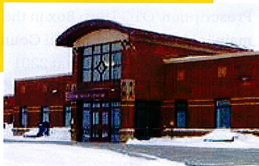
Kandiyohi County Law Enforcement Center

Ask for an officer if you need assistance, otherwise, drop the unneeded and/or expired medications in the drop box